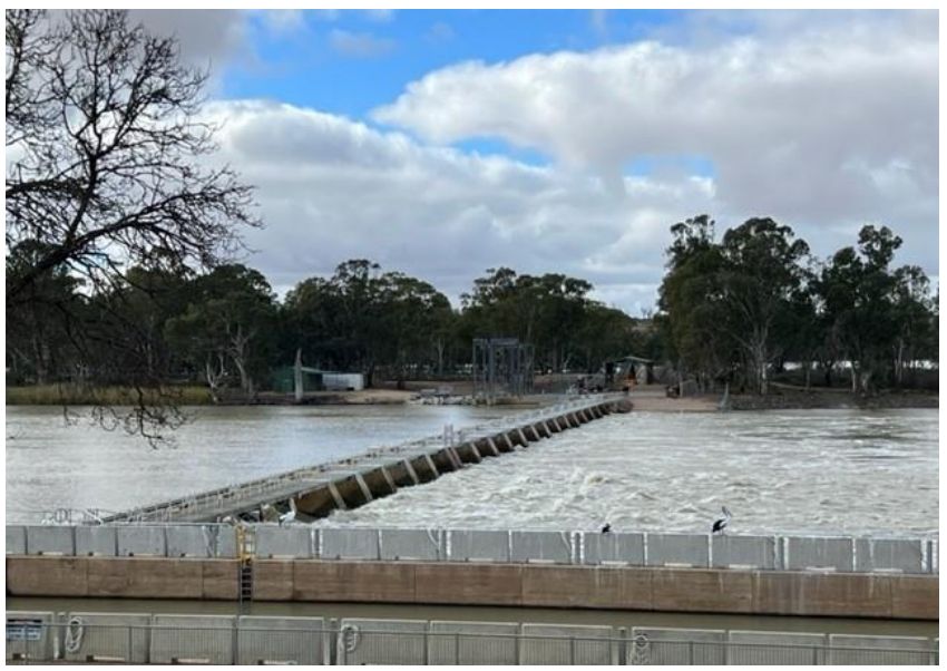
Figure 1: Higher flows passing Lock and Weir 1 at Blanchetown SA

The flow over Lock 1 is approximately 40 GL/day and will increase to around 42 GL/day over the coming week.